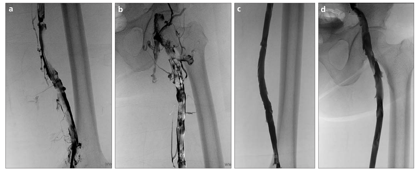
Figure 1. a–d. A 57-year-old woman with right-sided acute iliofemoral deep venous thrombosis. The venograms obtained after the right popliteal vein puncture shows acute thrombosis up to the right common femoral vein in the prone position ( a , b ). The same vein is patent without residual thrombus after manual aspiration thrombectomy using a 9 F guiding catheter ( c , d ).